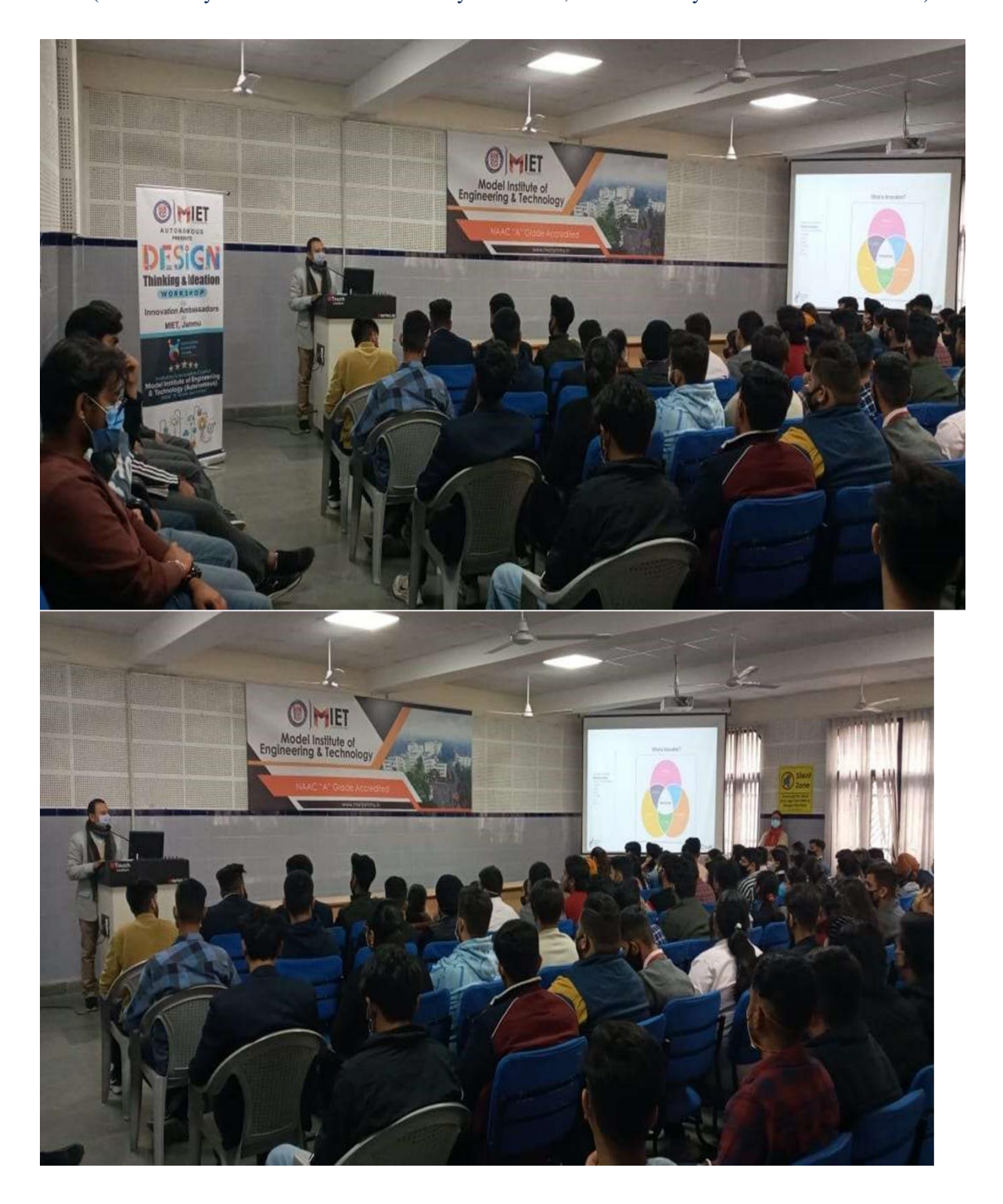
Fig2: Enthusiastic audience

Model Institute of Engineering & Technology (Autonomous) (Permanently Affiliated to the University of Jammu, Accredited by NAAC with "A" Grade)