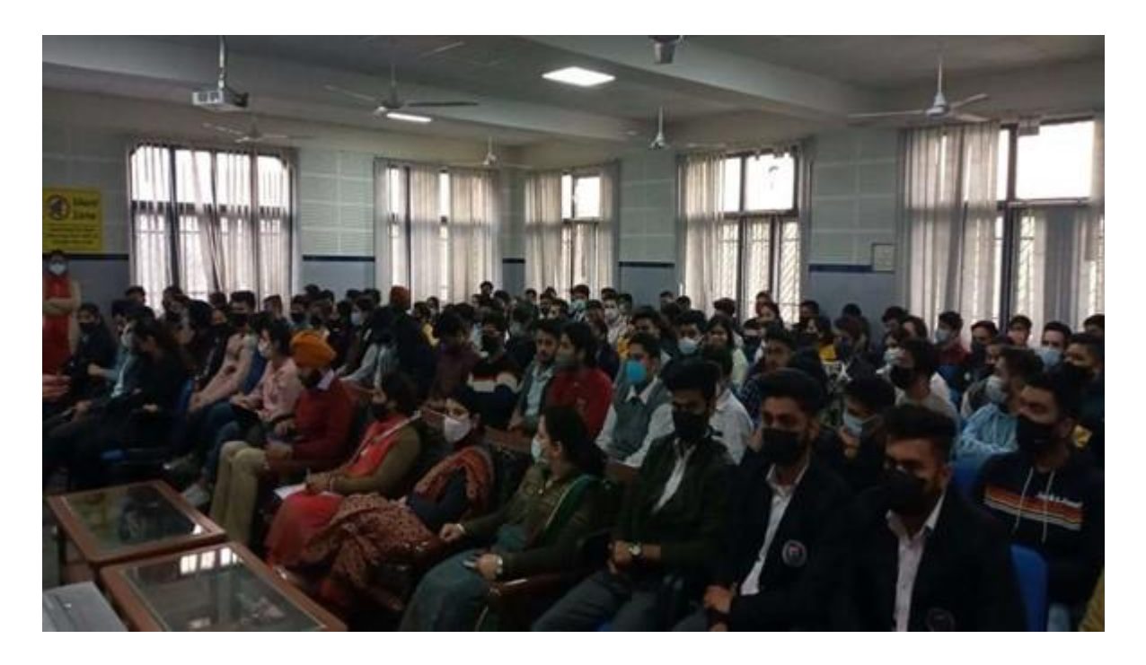
Fig 1: Everyone participated enthusiastically and enjoyed the session