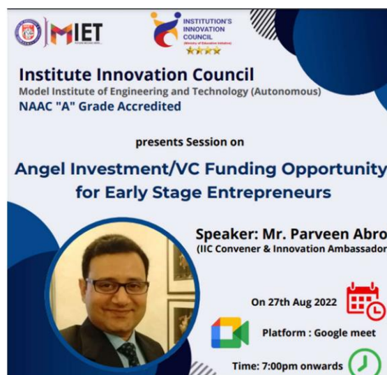
Fig 1: Poster of the event